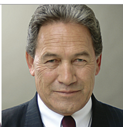
WINSTON PETERS NZ FIRST